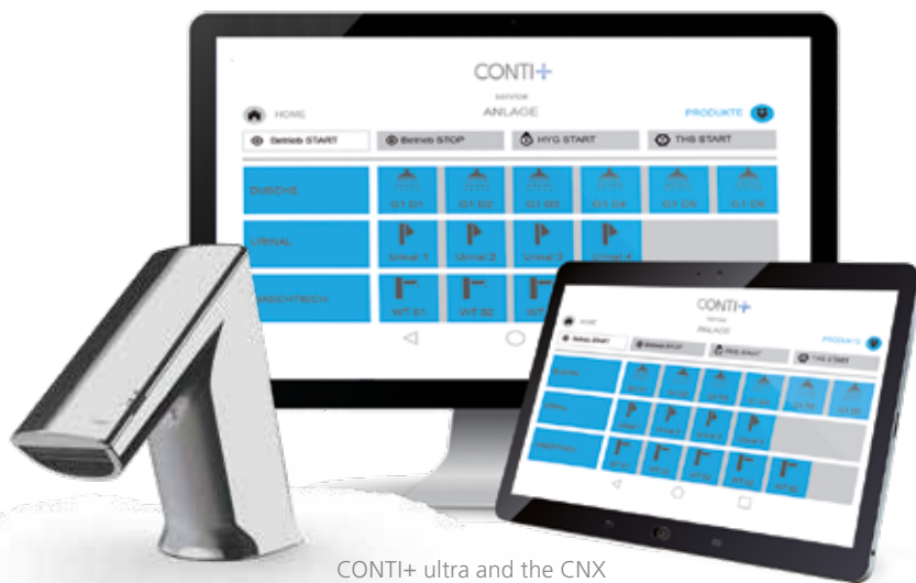
CONTI+ ultra and the CNX Water management system – Systematic approach with CONTI+

The intuitive CNX water management system from CONTI+ has been created to meet the most demanding hygiene requirements. The user friendly interval or calendar functions present an easy way to automate and efficiently document essential flushing.