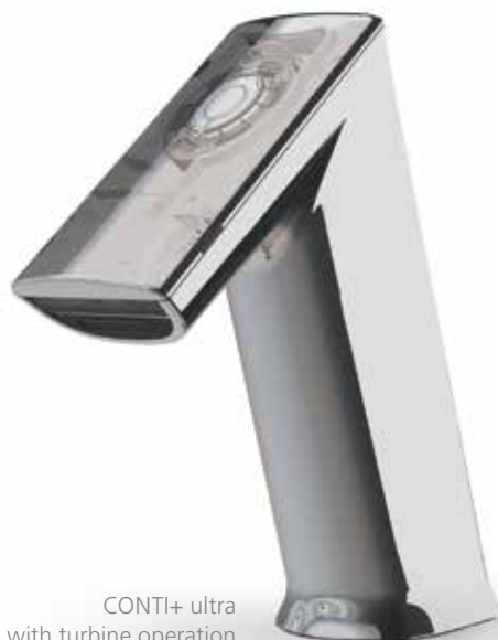
CONTI+ ultra with turbine operation