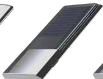
Public Solar Energy from solar cells extends the battery life to up to eight years.