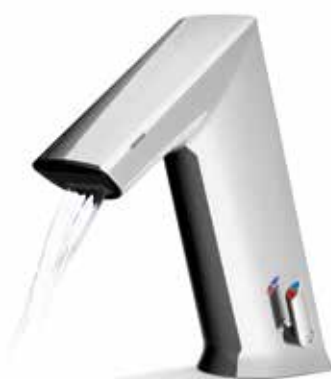
5.7 l/min laminar aerator