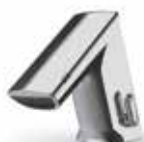
GS Total height: 123 mm Spout height: 51 mm

CONTI+ ultra is available in three sizes with or without temperature control and drain assembly. Each model is ready for data exchange via cable or wireless connection.