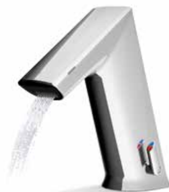
1.9 l/min spray aerator

Individual aerators: flow rates of 5.7 l/min down to a water saving 1.9 l/min with three different spray patterns – suitable for all applications.