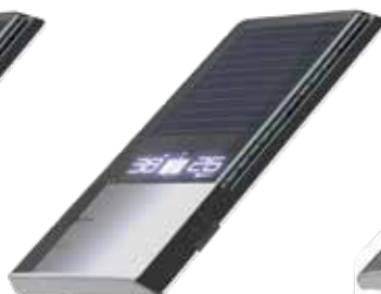
Expert Solar Solar cells together with display of water temperature and water running time.