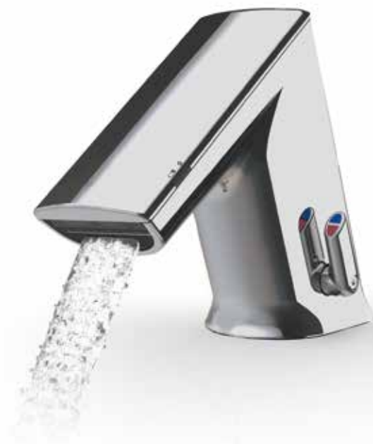
CONTI+ ultra GS: Short faucet – with a high level of functionality and innovation

A complete service can only be undertaken above the washbasin. Operating states, such as 'battery low', can be easily identified by the LEDs on the side.