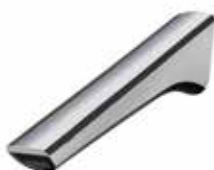
Wall without solar Spout length: 240 mm Spout height: any

The CONTI+ ultra wall model, with its high quality design, is suitable for use in hygienically critical environments or where installation on a washbasin is not desirable.