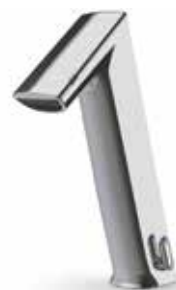
GH Total height: 252 mm Spout height: 162 mm