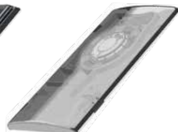
Turbine Energy from turbine extends the battery life to up to eight years.