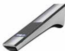
Wall with solar Spout length: 240 mm Spout height: any