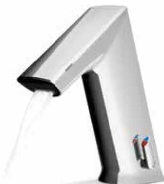
5.7 l/min jet aerator