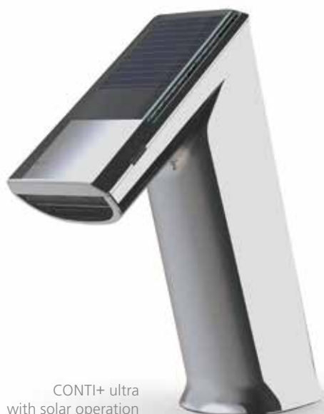
CONTI+ ultra with solar operation

Battery life extended by up to eight years due to optional turbine: this mini power station uses flowing water to generate electricity. The perfect solution for facilities with heavy footfall.