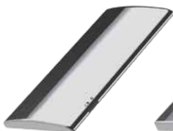
Public The definitive model for use in public areas. A clear, well rounded electronic module.

Stylish technology offering a variety of modules and superior energy options. All types of sanitary facilities are catered for with four energy options: mains, battery, solar and turbine operation.