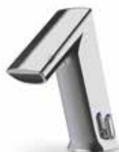
GM Total height: 178 mm Spout height: 94 mm